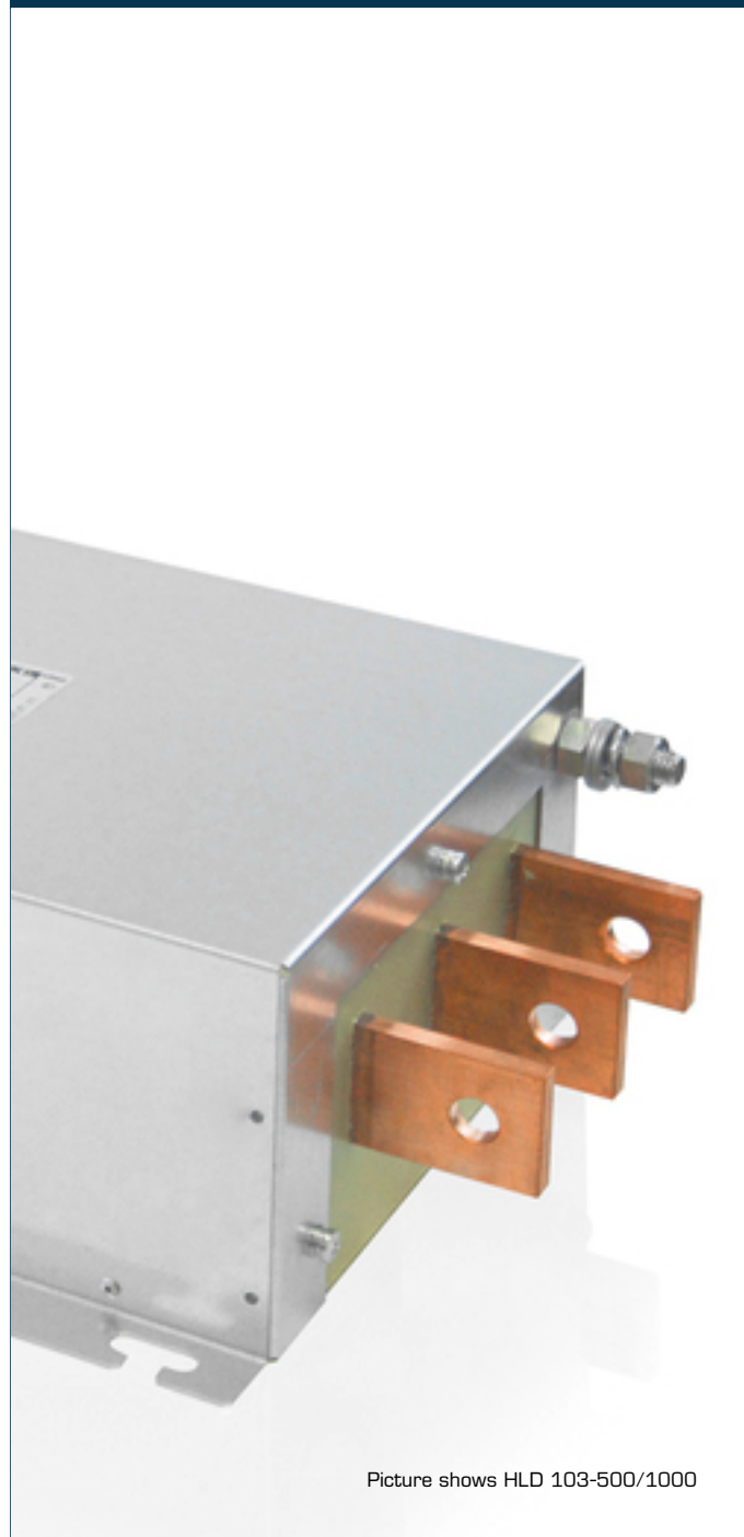
Picture shows HLD 103-500/1000